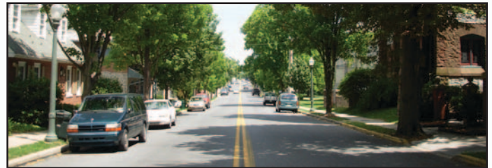
Tree lined streets reduce cooling costs for buildings