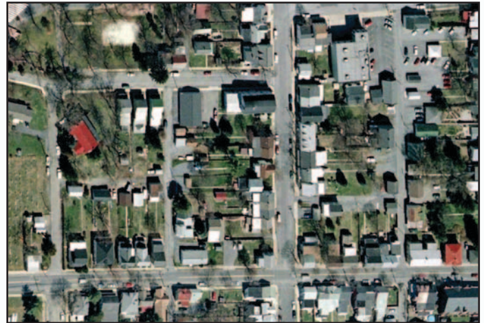
Short, narrow lots increase density and reduce runoff