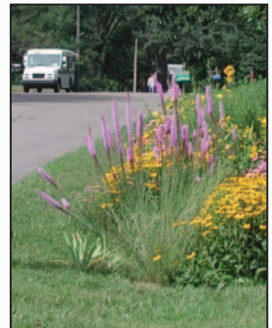
Attractive bioswales filter stormwater runoff from streets