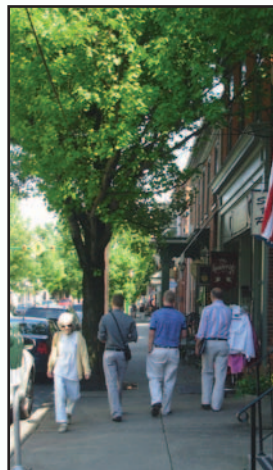
Networks of walkable streets promote health of residents and visitors