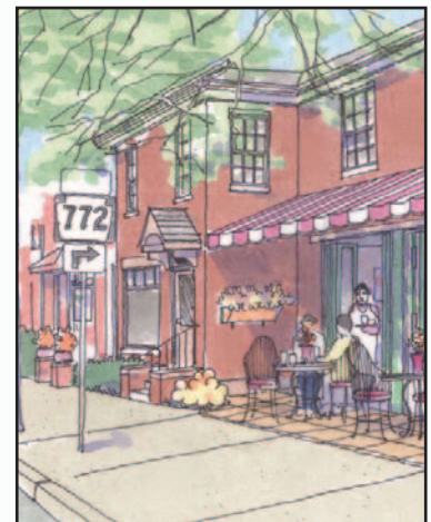
Outdoor Dining Along Broad Street

Note: The above images are from Derck & Edson Associates, Downtown Lititz Master Plan, dated September 1, 2008