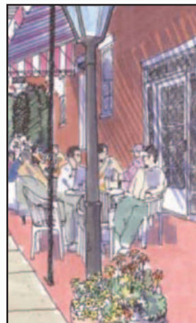
Zum Anker Alley Outdoor Dining