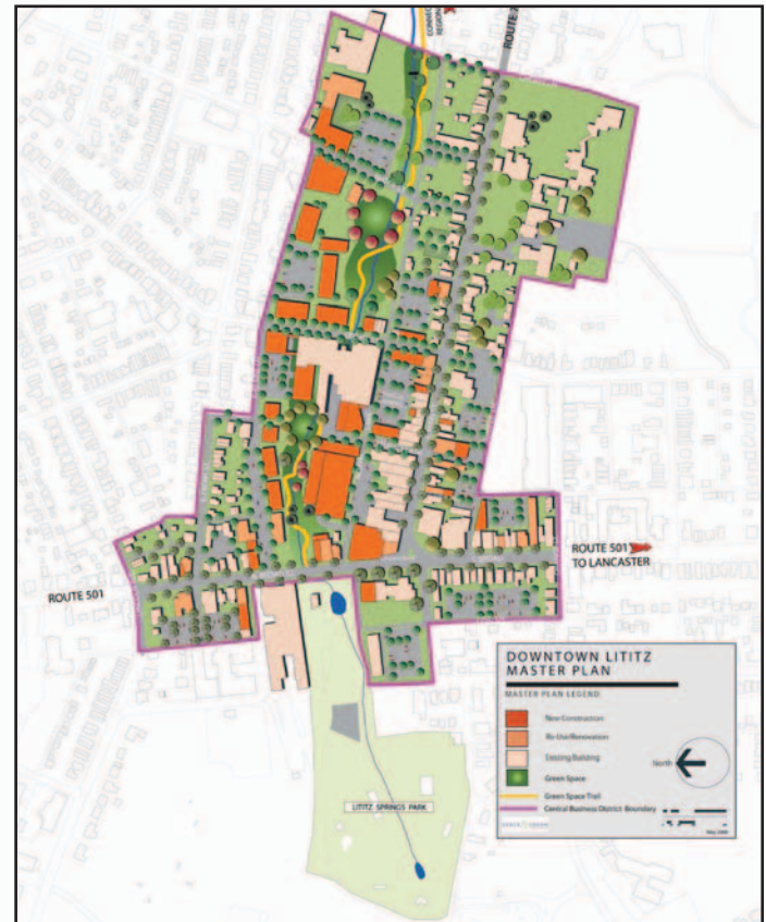
Downtown Lititz Master Plan