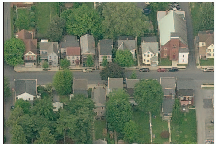
Traditional Lititz Neighborhood to inspire TNDO