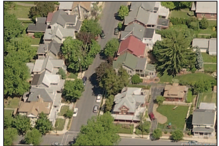
Traditional Lititz Neighborhood to inspire TNDO