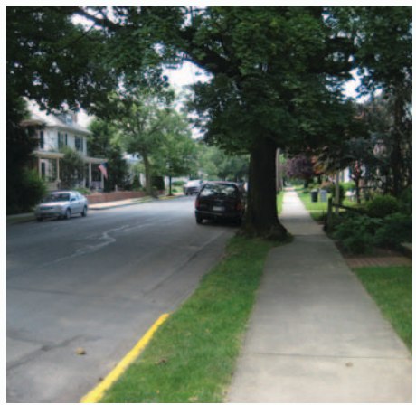
Existing assortment of impervious paving types which attempt to replicate brick and stone masonry.